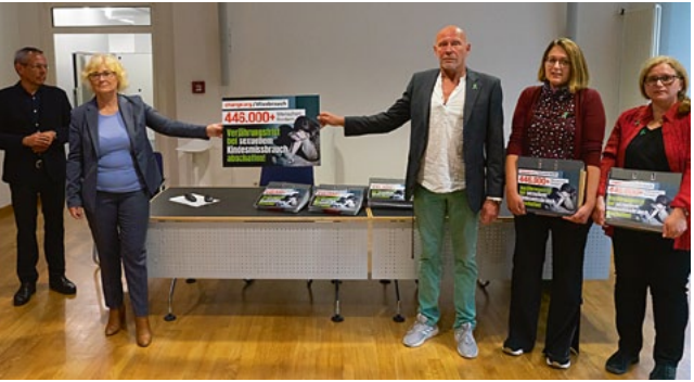
Handover of more than 446,000 signatures for the abolition of the statute of limitations for child sexual abuse on 29 June 2020 to Federal Minister of Justice Mrs. Christine Lambrecht